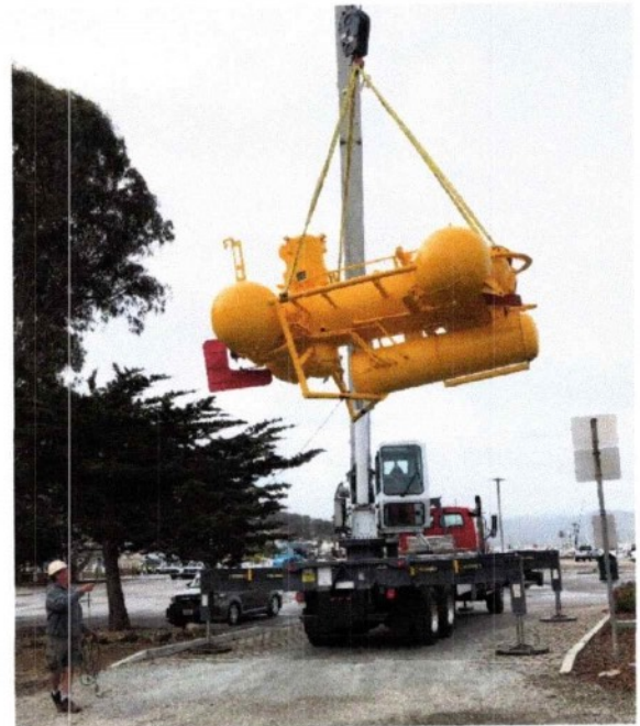
Installing the "ab sub"