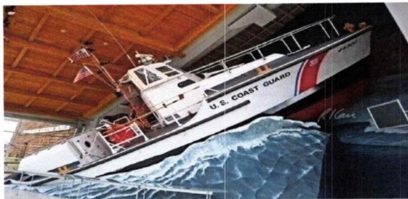
Astoria Oregon Maritime Museum's USCG surf rescue boat dioramic exhibit

Having additional space would also allow us the ability to construct a dioramic exhibit, if the Harbor Department so desires, of the soon to be retired 3868 Radon design Harbor Patrol Vessel. This popular proven vessel was specifically built for our coastal waters. It was designed and built by Morro Bay's pioneering boat building Radon family. At one point Radon Boats built 90% of all California coastal commercial Abalone/Urchin commercial dive vessels. Further, a dioramic display could be produced to exhibit the hazardous bar at Morro Bay's harbor entrance and the role that both City Harbor Patrol and USCG staff routinely deal with. A Morro Bay Maritime Museum member has also pledged $15,000 towards this project.